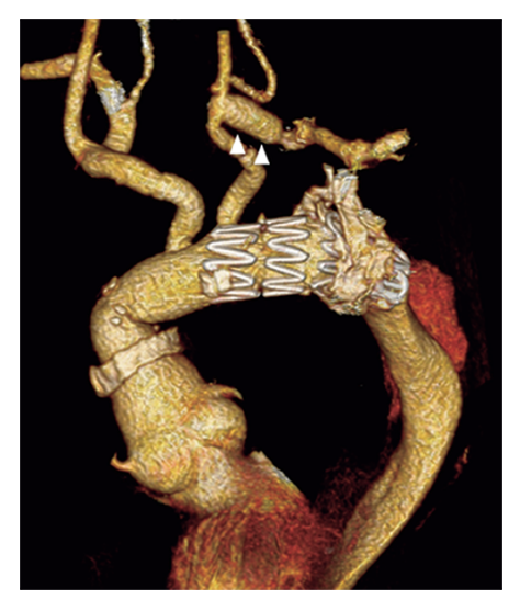
Fig. 3 CT angiogram after the redo surgery revealed a patent autologous iliac artery graft ( arrowheads ). The distal anastomosis of the branched graft was reinforced by the stent graft because of fragility of the anastomosis site. The left vertebral artery re-anastomosed to the left common carotid artery.

There is currently no definitive therapy for graft infection. The recommended treatment for an infected thoracic graft comprises the use of appropriate systemic antibiotics, complete debridement of infected and necrotic tissue surrounding the prosthetic material, mediastinal irrigation, in situ replacement of the infected aortic graft with a new graft, and graft coverage with viable tissue [2]. Although there are several case reports of successful conservative treatment strategies that preserved the infected graft and local therapy (including drainage, debridement, and NPWT) with or without tissue flap coverage [8], the failure rate seemed to be high; such strategies should therefore be indicated only