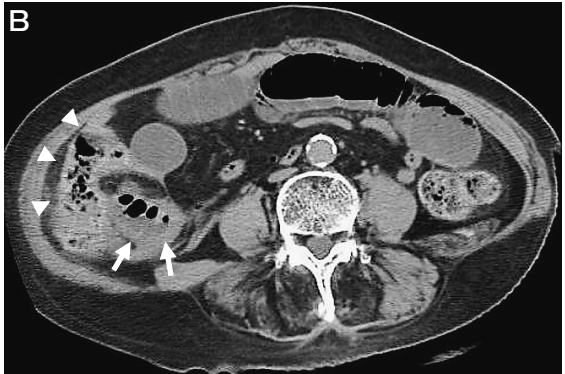
Fig. 1 A, Abdominal CT scan shows the stenotic lesion of small intestine, the finding of a "beak sign" around the cecum (arrow) and the dilation in the oral side of the small intestine obstruction; B, A dilated small intestine on the back of cecum forced the cecum to the anterior and lateral sides. (arrow, small intestine; arrowhead, cecum)