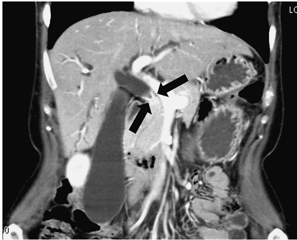
Fig. 1 Abdominal computed tomography demonstrated a contrast-enhanced bile duct tumor (arrows) accompanied by a proximal dilatation of the biliary tract.

distant metastasis nor other primary cancers were found. A subtotal stomach-preserving pancreaticoduodenectomy was performed. The wall of the portal vein (PV) was adhering too tightly to be detached from the tumor, and so it was resected concomitantly.