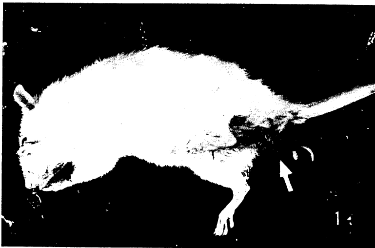
Fig. 1 A mother injected with 5 mg progesterone per day died with young in uterus and vagina during prolonged and arrested labour. The arrow indicates a fetus.