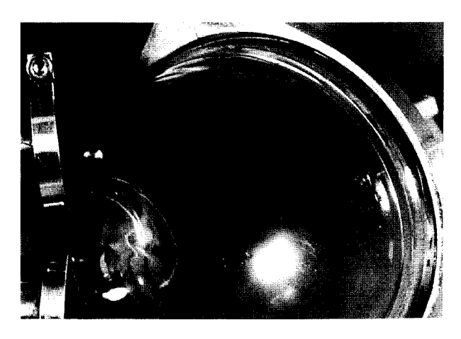
Fig. 3 Membranous thrombus formed on the blood chamber after 91 h of pumping.

The postoperative course is shown in Fig. 2. On the 1st POD, the cardiac index was 1.6 l/min/m^2 . Although chest drainage decreased to 45 ml/h on the 2nd POD, arterial oxygen tension fell to 70 mmHg with the inspiratory fraction of oxygen at 1.0. A chest X-ray revealed an enlargement of the mediastinal shadow around the inflow cannula. At reexploration, a bleeding point was found at the dehisced anastomosis of the Dacron atrial cuff. After the repair, arterial pressure rose to above 100 mmHg, while the cardiac index stayed low at 1.7 l/min/m^2 . On the 3rd POD, the cardiac index increased to 2.3 l/min/m^2 and then weaning of the LVAD was begun; the pumping rate was reduced to 45 beats/min. The patient's hemodynamics on the 4th POD were stable with a minimum LVAD support at 40 beats/min and were not